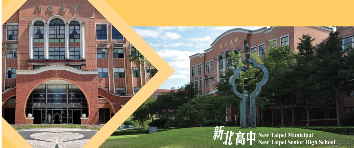
新北高中 New Taipei Municipal New Taipei Senior High School